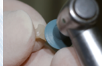
High-gloss polishing using OptraFine®