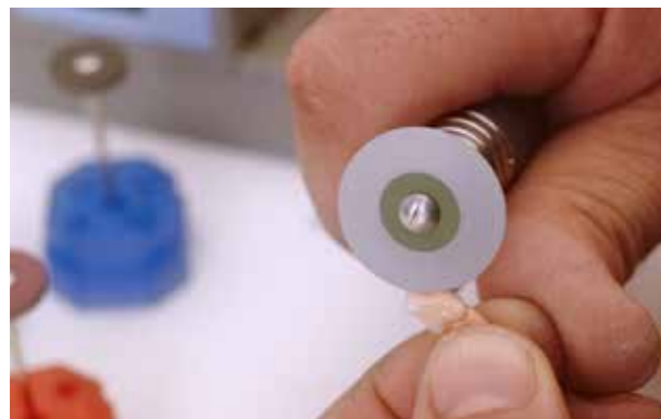
Item No. 122-0003 MPF Rainbow Ceramic Polisher Fine, Grey, RPM 10000-13000

For minimal reduction on zirconia marginal regions and for contouring all types of ceramic materials.