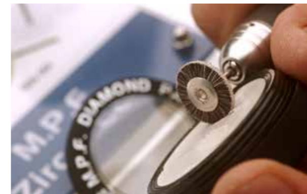
Item No. 124-0001 Polishing Brush, 100pcs. Item No. 124-0002 Polishing Brush, 50pcs. Item No. 124-0003 Polishing Brush, 25pcs.

Made from natural hair. For an exceptional alloy polish.