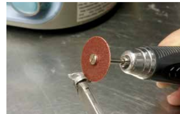
Item No. 123-0001 Middle 25 x 0.6 x 1.8mm, 100pcs. Item No. 123-0002 Large 38 x 0.6 x 1.8mm, 100pcs. Item No. 123-2003 Small 22 x 0.2-0.25 x 1.8mm, 100pcs.

Highly durable discs for ceramic and alloy restoration, without the risk of chipping or cracking the surface.