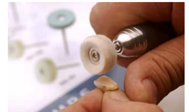
Item No. 125-0001 Polishing Mop, 100pcs. Item No. 125-0002 Polishing Mop, 50pcs. Item No. 125-0003 Polishing Mop, 25pcs.

Made from natural hair. For an exceptional alloy polish.